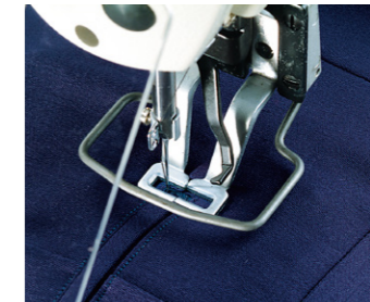
LK-1900S-S type (Bartacking pocket lip of suits)