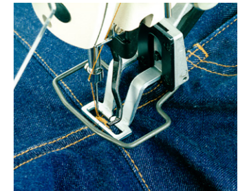
LK-1900S-H type (Bartacking crotch of jeans)